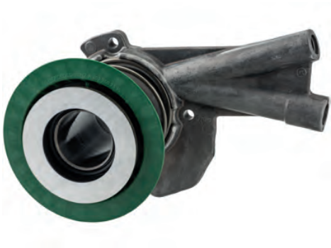
Release bearing without cable