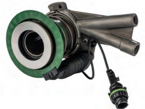
Release bearing with cable